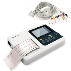
Monitoring equipment to be used includes electrodes, a small monitor device and cables.

It may be used to check whether abnormal heart rhythm or rate could be the cause of symptoms such as giddiness, fatigue, palpitations, shortness of breath, chest pain or a fainting spell, so that the right treatment can be given.